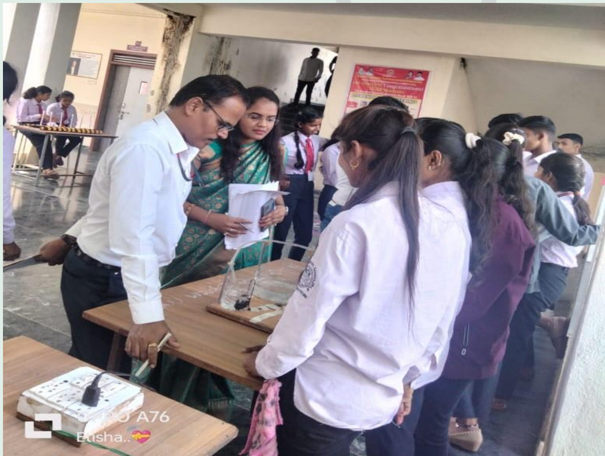
Photos showing the Model making Competition