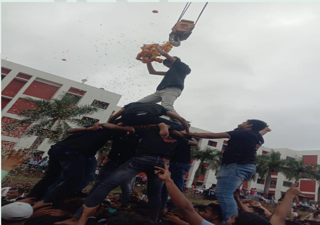
Photos showing on the occasion of Dahihandi Celibration-2k23