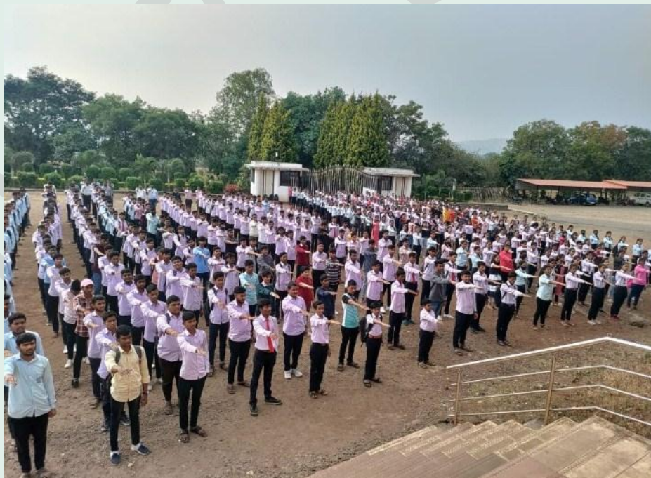
Photos Showing on the occasion of,"Constitutional days or Savidhan Diwas" & "26/11 Black day"