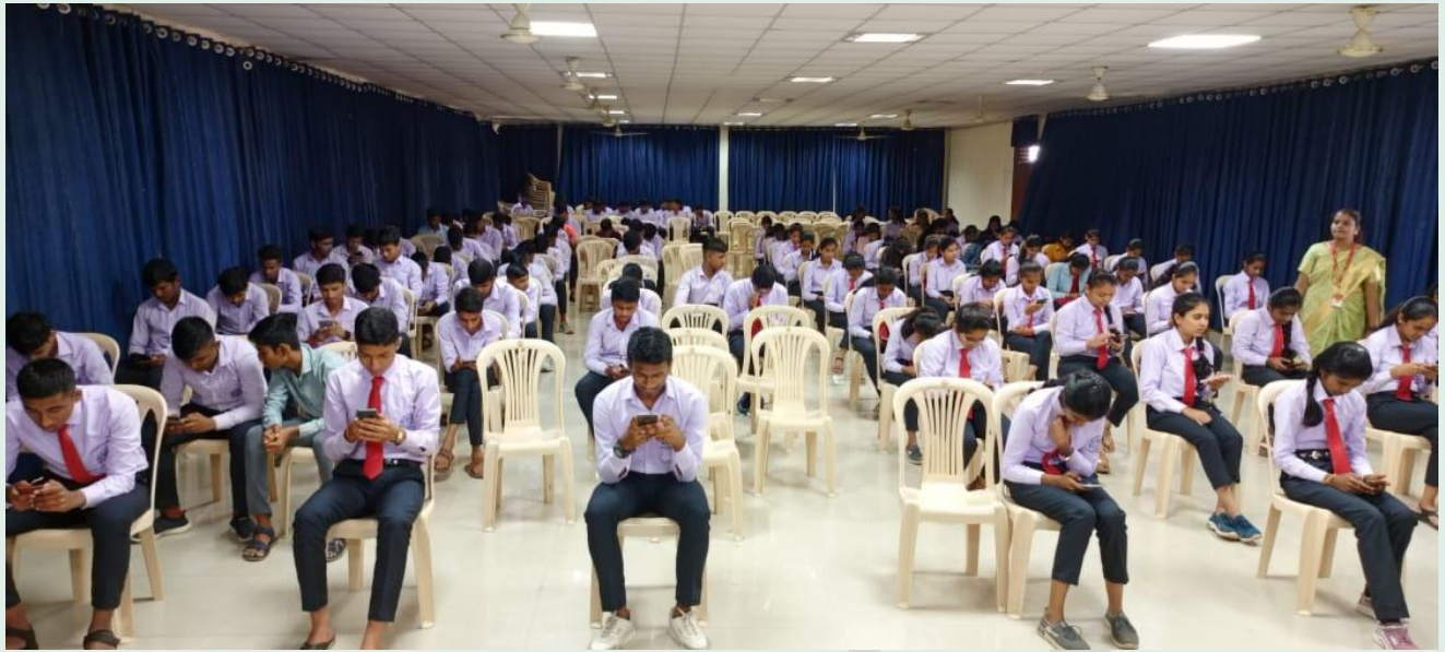
Photos showing the Quiz Competition.