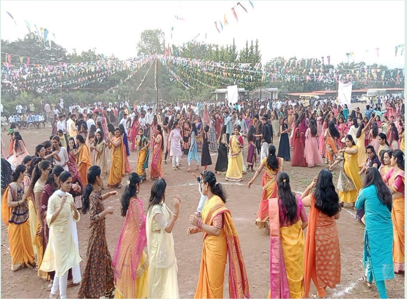
Photos showing the Navratri Dandiya Garba Day celebrating