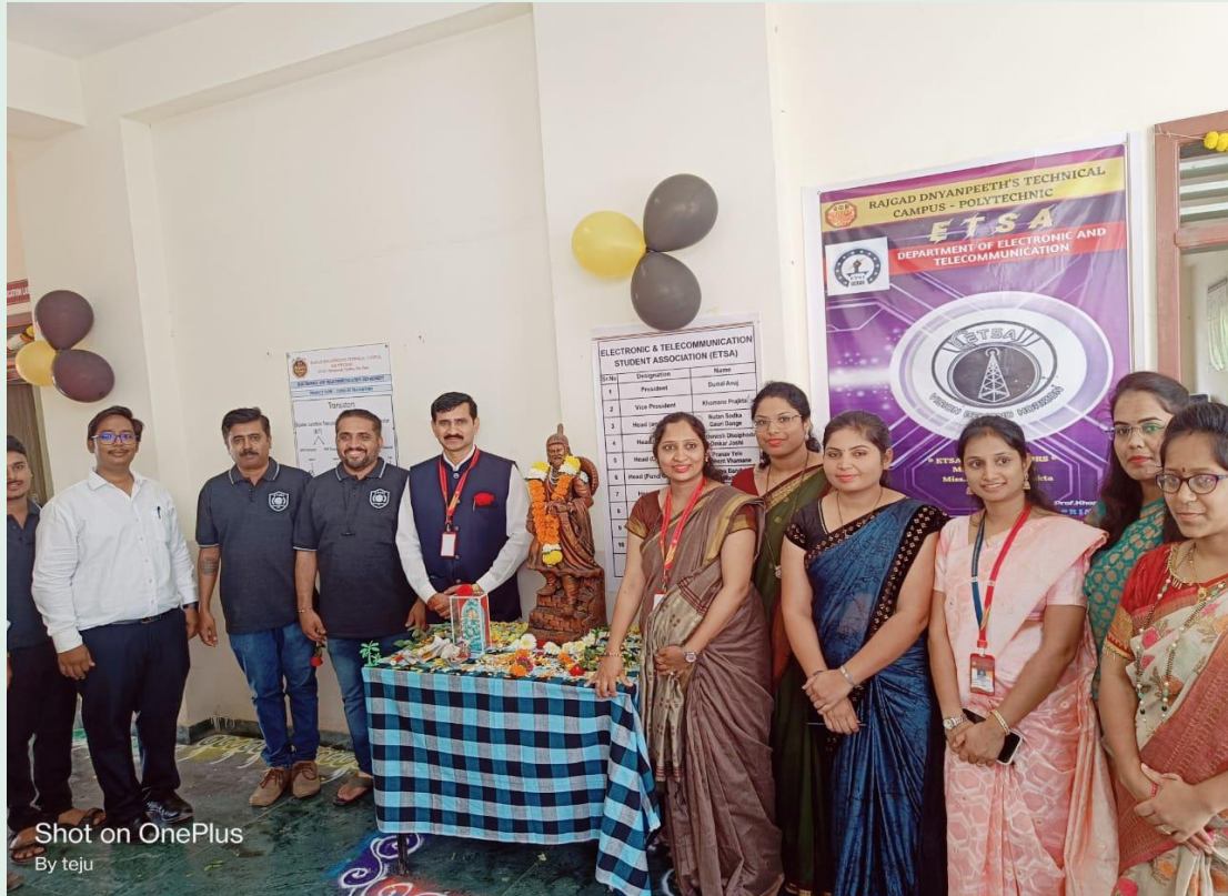
Photos showing the Engineering Day celebrating